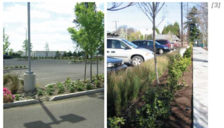
Off-Street Parking Lot Landscaping. Parking lot appearance and functionality can be improved by [1] a minimum perimeter setback of 6 feet with ground cover, shade trees, and shrubs that are a minimum of 3 feet high [2] internal landscaping strips that are a minimum of 8 feet wide [3] and stormwater detention and retention landscaping that reduces run-off while also providing a buffer between parking and pedestrians.