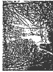
Outfall to Willamette River

The stormwater utility rate is made up of two components. The first component is the monthly administration fee which is a flat rate charged to all customers. The second component is the monthly charge per ERU.